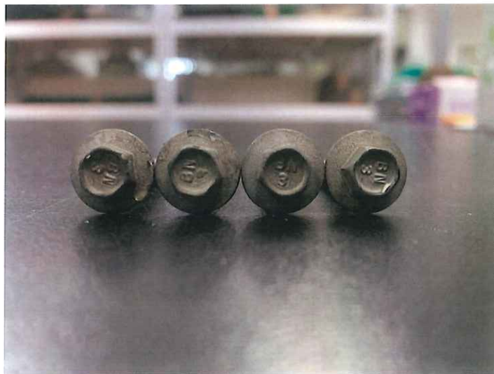
Fig. 3 : After test