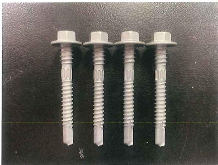
Fig. 1 : Received samples